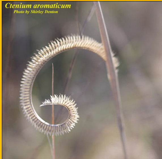
Ctenium aromaticum Photo by Shirley Denton

Photo by Shirley Denton, photo page 3 by Betty Wargo