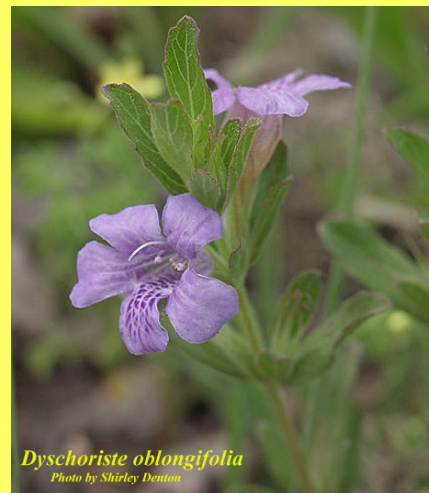
Dyschoriste oblongifolia