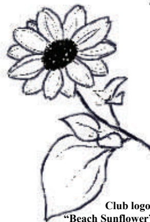
Club logo: "Beach Sunflower" Helianthus debilis

Suncoast Chapter of Florida Native Plant Society,