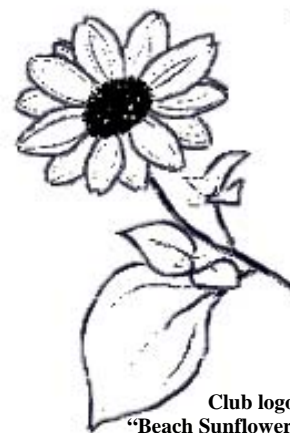
Club logo: "Beach Sunflower" Helianthus debilis