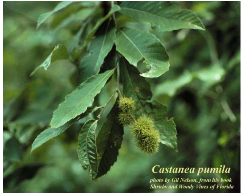
Castanea pumila